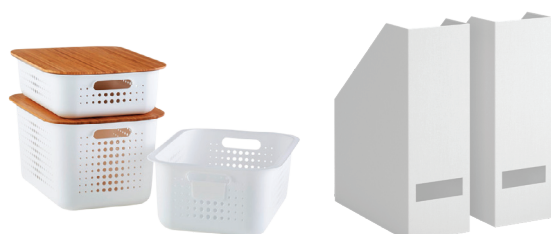
WHITE NORDIC STORAGE BASKETS WITH HANDLES, $8 TO $10, CONTAINERSTORE.COM.