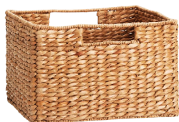
SEAGRASS UTILITY BASKET, $39, POTTERYBARN.COM .