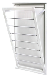
FOLDING DRYING RACK BY DOTTED LINE, $59, WAYFAIR.COM.