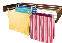
INDOOR/OUTDOOR WOOD FINISH RETRACT- ABLE WALL MOUNT DRYING RACK, $90, HOMEDEPOT.COM.