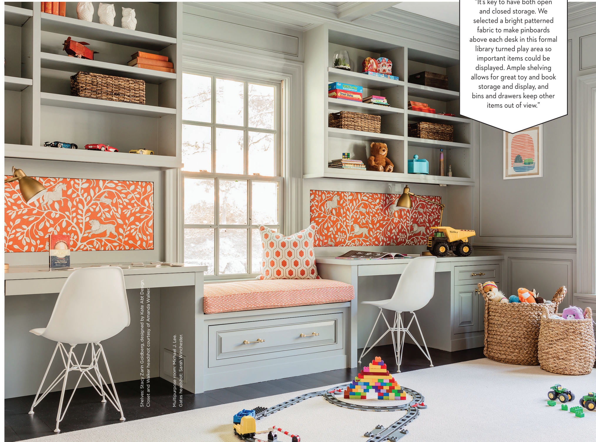
designed by Kate Alt Design.